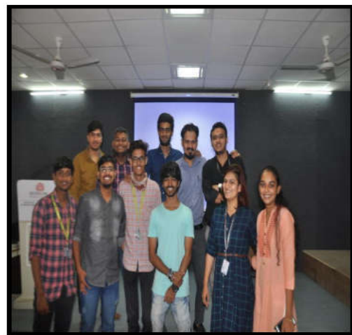
Silver Maple Students