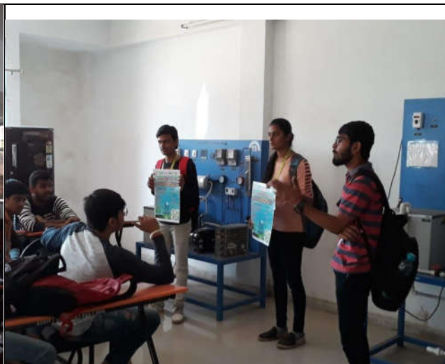
Briefing about e waste collection