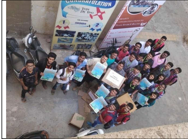
Team Ready for Campaigning