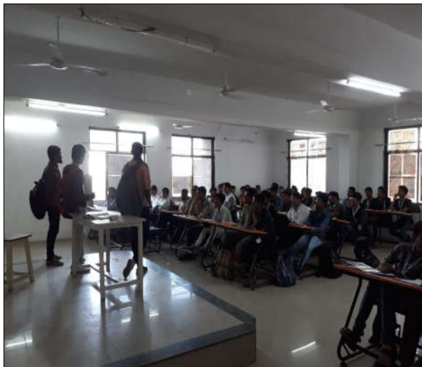
Briefing about the collection